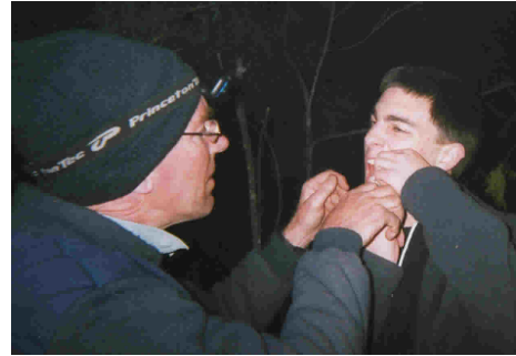
Emergency braces surgery

Doug's new braces presented a problem when one of the wires came loose. 007 applied emergency brace's first aid with 'leatherman' pliers – sorted at least until Monday.