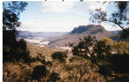
Donkey Mountain: used for map & compass exercise

12:00 stop for map & compass exercise using Donkey Mountain for bearings: "Triangulation" now called Resection, importance of 90 degree bearings, GPS & map datum settings.