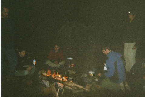
Saturday night campfire