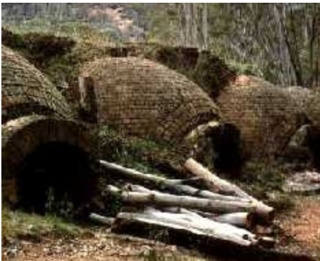
Bee hive ovens at Newnes

and return by 10:30am. Camp site pickup; Departed by 11am.